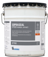
Sopraseal Stick Primer 19 L (5 gal. US) code: 37782