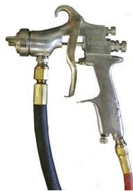
Spray gun with 9.5 mm nozzle Lemmer A-908 Conventional Spray gun