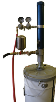
Pump Lemmer RP-1202 with hose