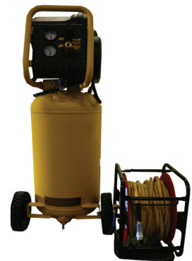
Compressor 8 CFM minimum